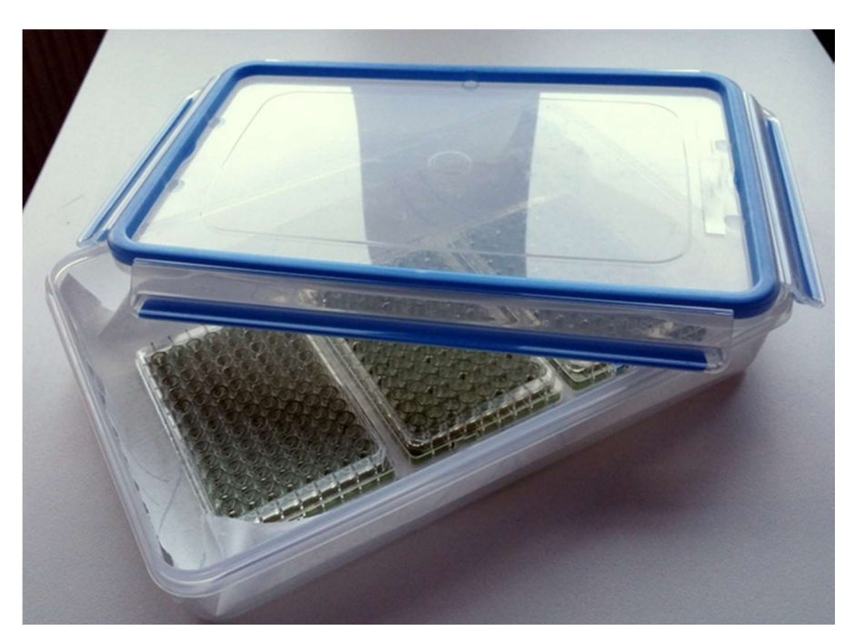
Fig. 2: Exemplary storage box with paper towel, holding 3 Multiwell plates.