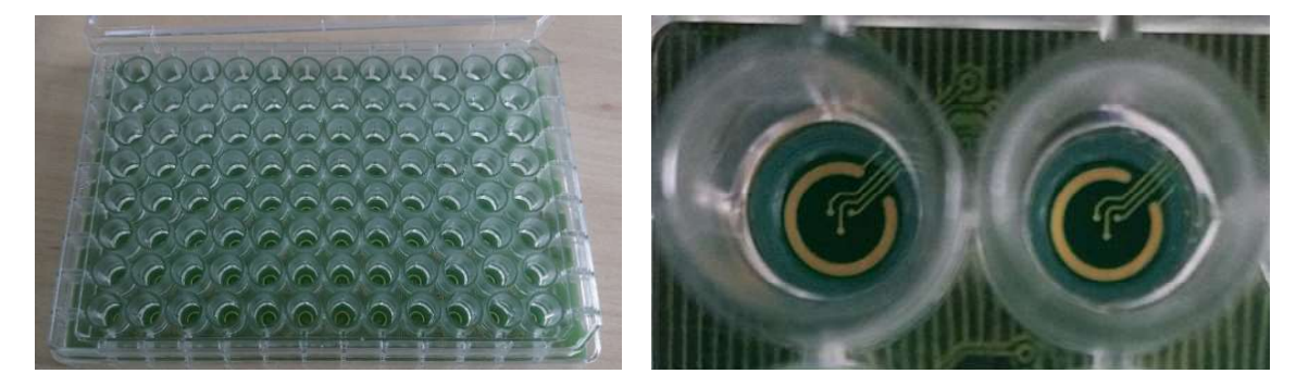
Fig. 3: 96-well Multiwell plate. Left: Overview, right: Microscopic view into two wells. Note the three electrodes in the center of the well and the circular reference electrode. Cells ideally are only plated in the center without covering the reference electrode.