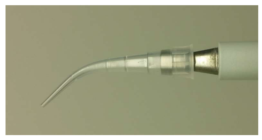
Fig. 1: Kinked 10 µl pipette. The tip was softened using a crème-brule burner and a forceps.